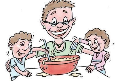
Illustration by Rob Foste

Even if the only food you can afford or source is the conventionally produced meat, seafood, and produce on sale, that's okay. The point is to make you aware of the differences so that you can make the best choices within your means—not to bankrupt you! Many people find that as they progress on their health journey, they are able to dedicate more funds to quality foods. This might reflect money saved by avoiding restaurants, fast food, and prepackaged foods. Or it might reflect reduced medical expenses once you start feeling better. Sometimes it just reflects a shift in priorities and a choice to reduce expenses or go without in some other area of life in order to free up funds for local, grass-fed meat.